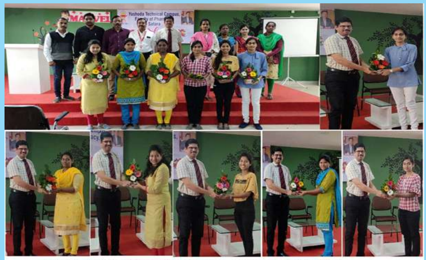
GPAT 2020 Qualifier Felicitation Program held on 05/02/2020