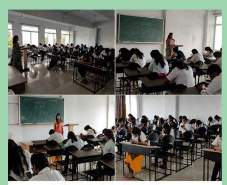
GPAT Test No. 01 conducted on 28th August 2019

Yashoda technical campus, Faculty of Pharmacy initiated GPAT Lectures and routine test for B Pharmacy Third & final year students. GPAT exam is very important to get admissions for M Pharmacy. So while understanding importance of the GPAT exam and in order to make them eligible for further education yashoda college