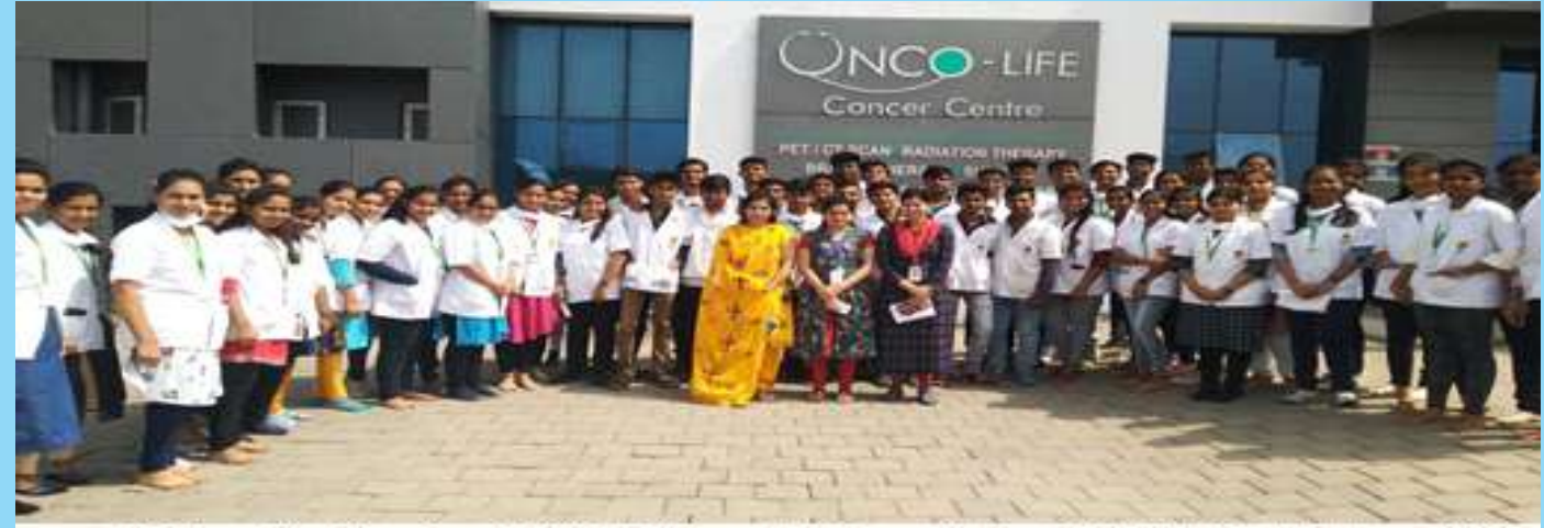
B. Pharm First Year Hospital Visit To Onco- Life Cancer Centre, SATARA. On 8th February 2020